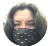
Bannock Thee Hammock