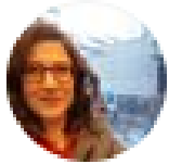
Nora Loreto @NoLore

We just found 215 kids in a forgotten grave and I don't see the same pause.